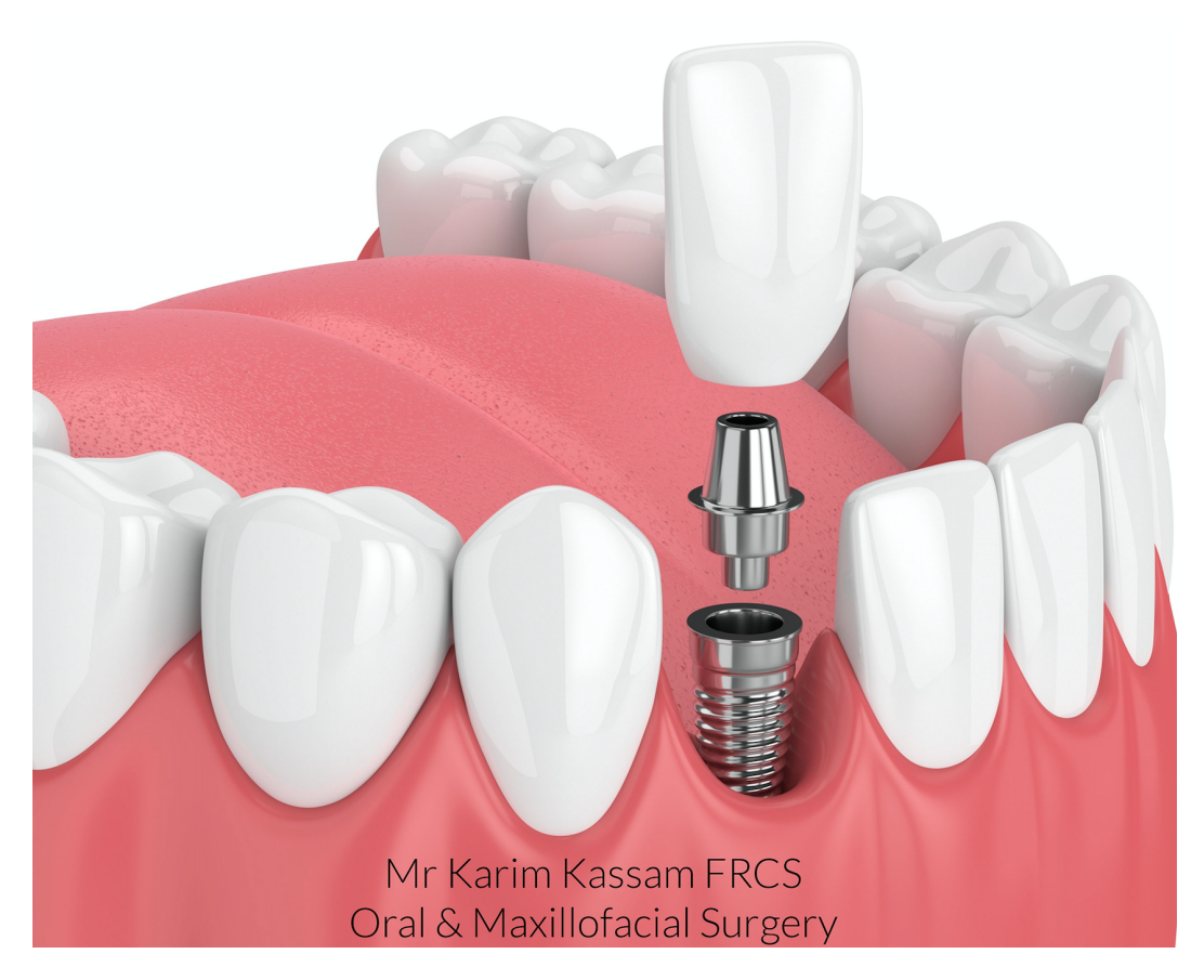
DENTAL IMPLANT, ABUTMENT AND CROWN